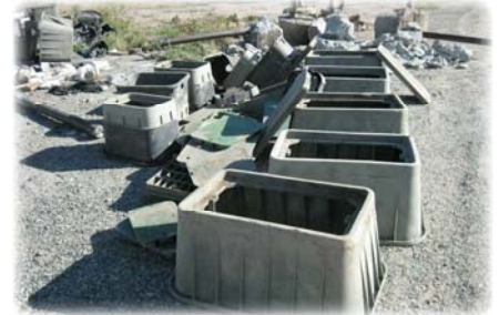
Removal of the Daniels Horizontal Extensometer