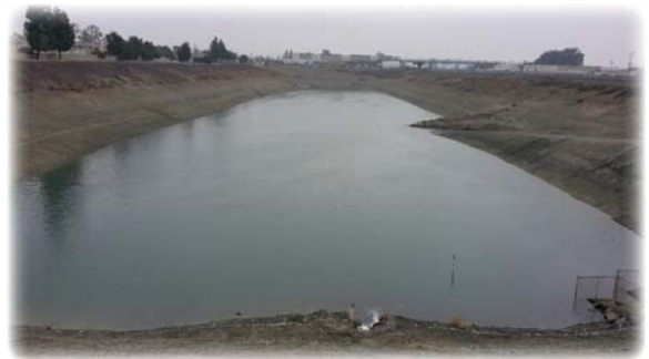
Brooks Basin After a Rain Storm Event

Watermaster and the IEUA measure the quantity of storm and supplemental water that enters into recharge basins using pressure transducers or staff gauges that measure water levels during recharge operations. They also collect weekly water quality samples from recharge basins that are actively recharging recycled water and from lysimeters installed within those recharge basins. Additionally, imported water quality data for State Water Project water are obtained from the Metropolitan Water District of Southern California (MWDSC) and recycled water quality data for the RP-1 and RP-4 treatment plant effluents are obtained from the IEUA. Combining the measured flow data with the respective water qualities enables the calculation of the blended water quality of the recharge sources in each recharge basin and assess if there is adequate dilution of recycled water as required by the recycled water recharge permits held with the Department of Drinking Water (DDW). Additionally, the measurements of recharge are used to estimate the New Yield to the Chino Basin as a result of the recharge activities.