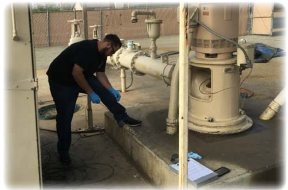
Maintaining Transducer Equipment in One of the Well Sites

All groundwater-level data are checked by Watermaster staff and uploaded to a centralized database management system that can be accessed online through HydroDaVE SM . During this reporting period, Watermaster measured 395 manual water levels at 80 wells throughout the Chino Basin, and conducted two quarterly downloads at about 130 wells containing pressure transducers. Additionally, Watermaster compiled all available groundwater-level data from well owners in the basin for the October 2015 to March 2016 period.